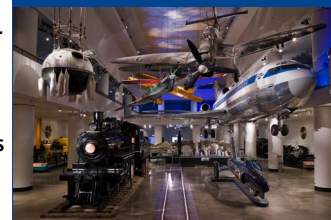
Explore the Museum of Science and Industry