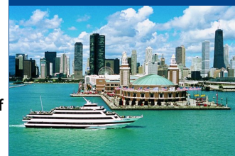
Enjoy a Skyline Cruise on Lake Michigan