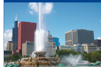
Guided Tour of Chicago

Day 9: Today after enjoying a Continental Breakfast, you depart for home... a time to chat with your friends about all the fun things you've done, the great sights you've seen and where your next group trip will take you!