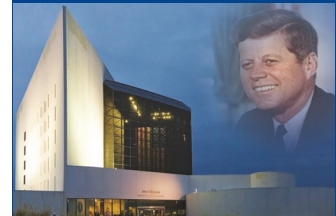
JFK Library & Museum