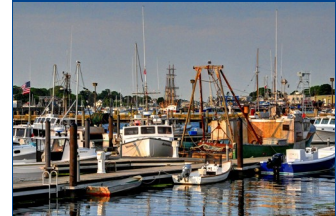
Historic Gloucester "America's Oldest Seaport"