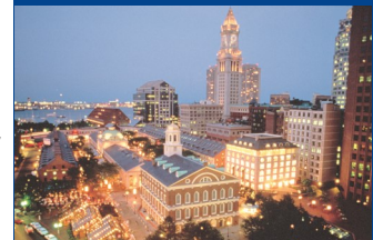
Faneuil Hall Marketplace